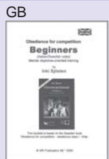
Beginner's Class (Italian rules)

Level 3. Booklets for obedience for competition