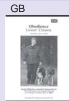
DVD 2007 Lower Classes