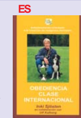
Obediencia Clase Internacional (FCI rules 2002)