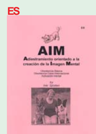
Adiestramiento orientado a la creación de la Imagen Mental

Plan de Trabajo. Paso 1,2,3. Ejercicios individuales, por parejas, y en grupo.