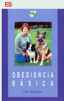
Course book Obediencia Básica

Level 1. Basic course of general obedience and mental activation