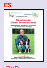
DVD Obediencia Clase Internacional (FCI rules 2002)