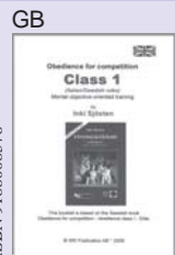
Class 1 (Italian rules)