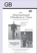
DVD 2007 International Obedience Cl. (FCI rules 2007)

These booklets and video give knowledge about how to train a dog in a positive way for competition. The words of command and the exercises are carefully described and illustrated.