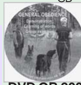
DVD OB 2009