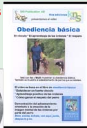
DVD Obediencia Básica 2005

Plan de Trabajo. Paso 1,2,3. Ejercicios individuales, por parejas, y en grupo.